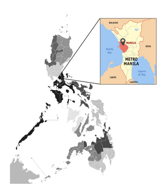
Figure 1. Map of Manila from the National Capital Region of the Philippines